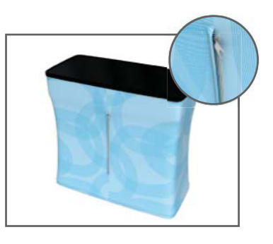
8. Zipper on back can be used to access internal storage.