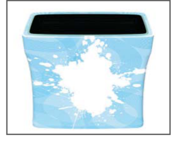
6. Smooth wrinkles and ensure that graphic is properly centered.