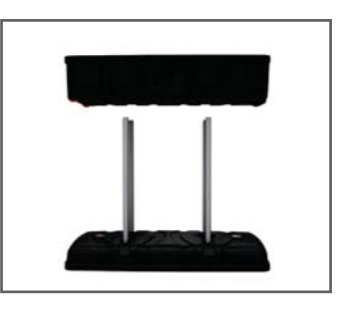
4. Lift the base and place it on top of the support poles, fitting poles firmly into place.