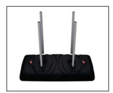
3. Put the lid (the side without wheels) on the floor first. Position vertical support poles firmly.