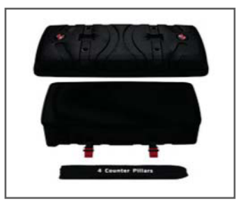
2. Lift lid and remove contents of case.