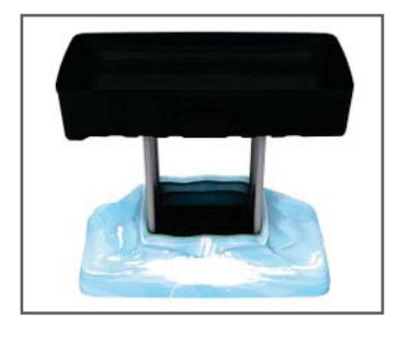
5. In a clean area, fit fabric graphic onto case from base to top. Make sure zipper is in the middle.