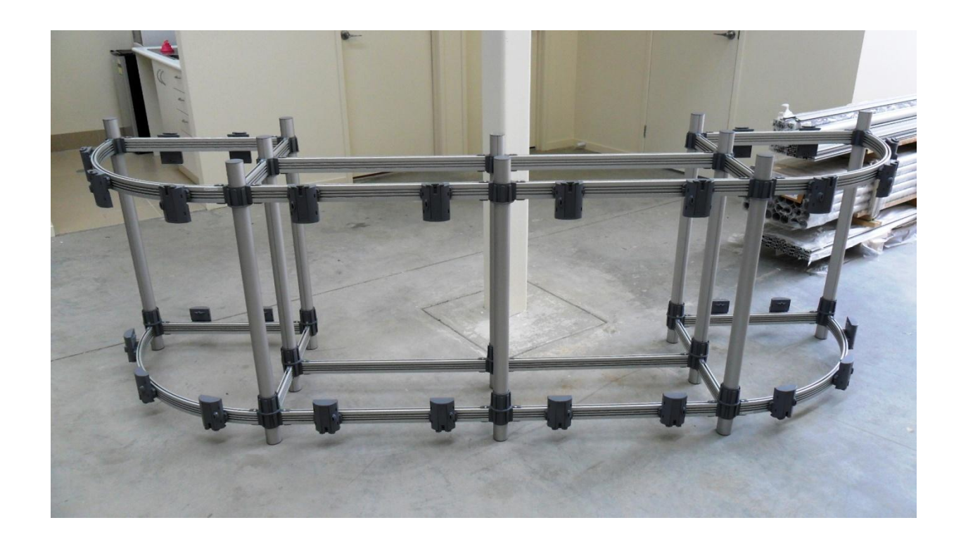
Step 3 – Fit the top and bottom Graphic Rails to the unit by sliding the tapered Hinge Blocks into the grooves on the Tensioning Units.